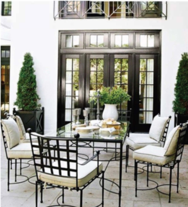
The Perfect Retreat.

A stretch of Highway 1 and blue skies, where Tom Petty's got your number and the airwaves are a salty mix of old school rock, easy listening, and a touch of magic. Summer has its way of transporting us to melodious places where we drown out the noise of everyday, and take in the coolness of the season. A wish to explore the fun side of our lives, taking ourselves less serious. In your attempt to want to ditch the office for a nice drive along the coast, let's talk about your outdoor space being summer ready before you jump out of your office chair. As a lover of summer, and designer; curating outdoor spaces that provide an escape for our clients is our specialty. Are you wishing right about now you could have easy quick tips to elevate your outdoor space? So do we! This is why we've put together five design tips to help you create the ultimate retreat.