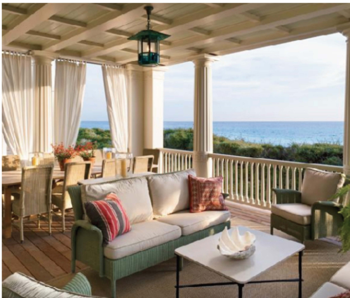
Maximize Your Seating

Take advantage of summer night breezes by outfitting your outdoor living with ample lighting. When you're entertaining in the evening, your space should be as well lit as your interiors. It won't be pleasant if you're trying to entertain, and your guests are sitting in the dark! Kichler is a great outdoor line, their lighting has a high quality finish that's fabricated for outdoor use.