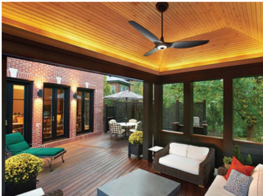
Keep it Cool

Furnish your outdoor space with weather-resistant pieces that flow with, and are similar in style to the design of your indoor space. This creates a seamless flow from the interior to the exterior spaces. Otherwise, the exterior will feel disconnected and out of balance compared to the rest of your home.